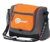
Carrying case WAFUTM6